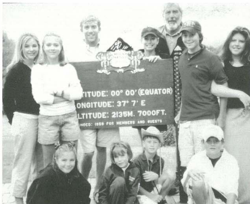
The family on a vacation in Africa